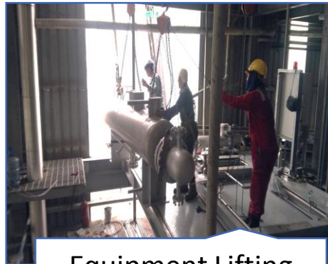
Equipment Lifting and Installation Work