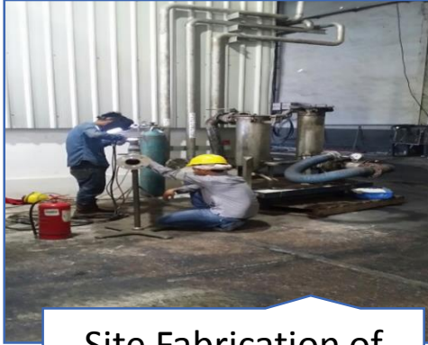
Site Fabrication of Pipe Spool