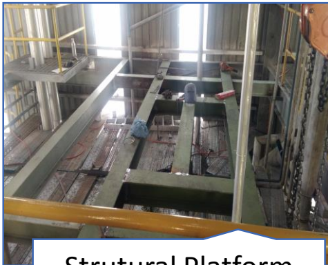
Structural Platform Work