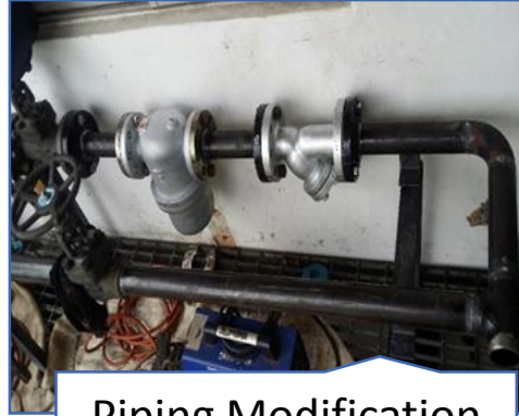
Piping Modification Work