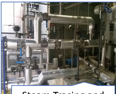
Steam Tracing and Insulation Work